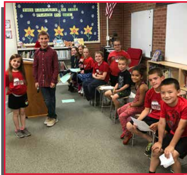
Students from several grade levels share how The Leader in Me has impacted their lives.