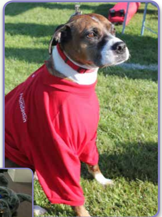
VCSF's unofficial mascot, Simon.