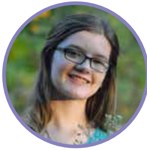
Mattison Bell Stanley Weinberg Memorial Scholarship $1,000